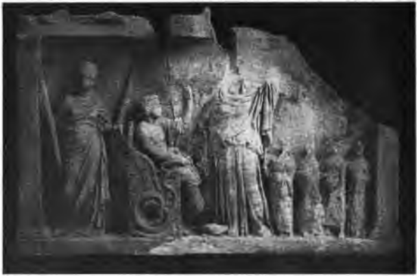
Fig. 45. Triptolemus in the dragon-drawn Chariot.

and given him everlasting youth, but now must he suffer the common lot of men. Yet I will give him imperishable honor since he has lain on my breast. But come now, build me here a temple, and the rites in it I will myself prescribe." So they built to Demeter a great temple, and when the child Triptolemus had grown